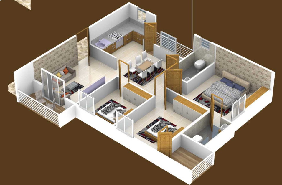
012 1365 SFT 3 BHK EAST