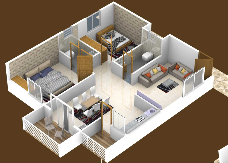
006 1060 SFT 2 BHK EAST