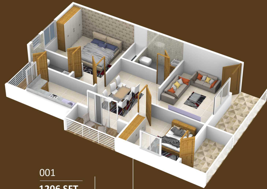
001 1206 SFT 2 BHK WEST