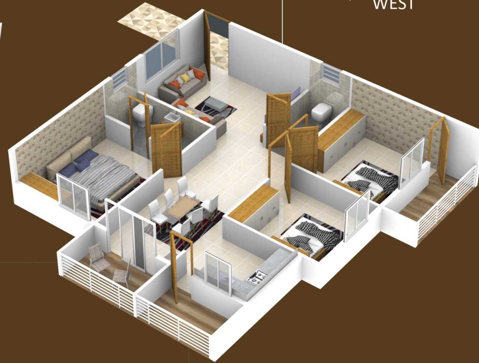
002 1361 SFT 3 BHK WEST